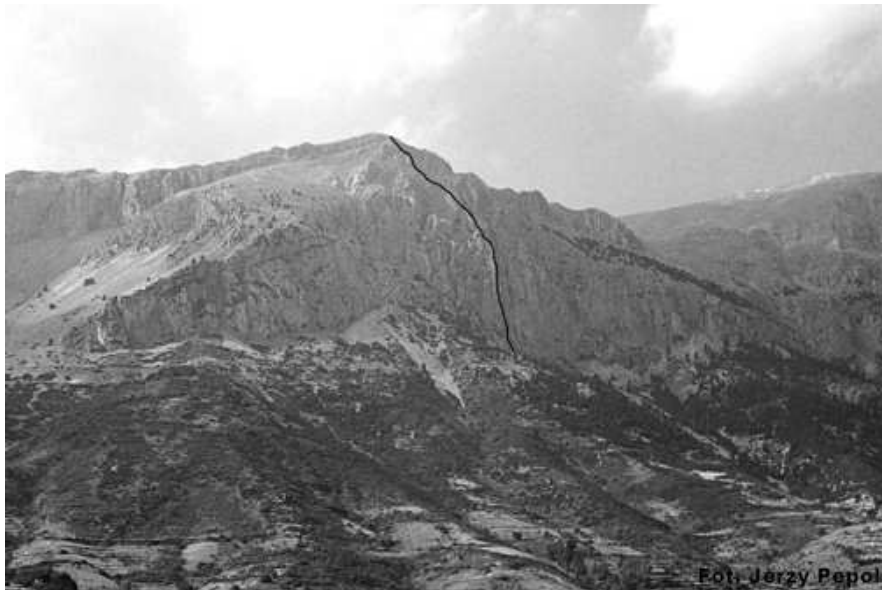
The route "Synantisi me ton Parnasso"