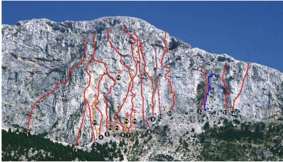
The route "Nychterines kampanes" (blue line). Route #12 is "Sfyri tou Tor".